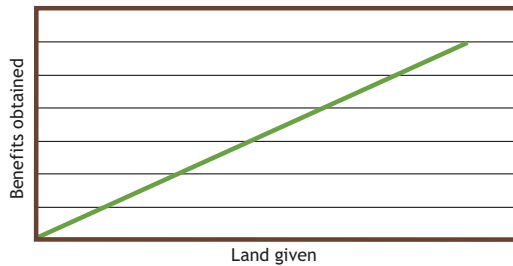
Old consensus on size and benefits